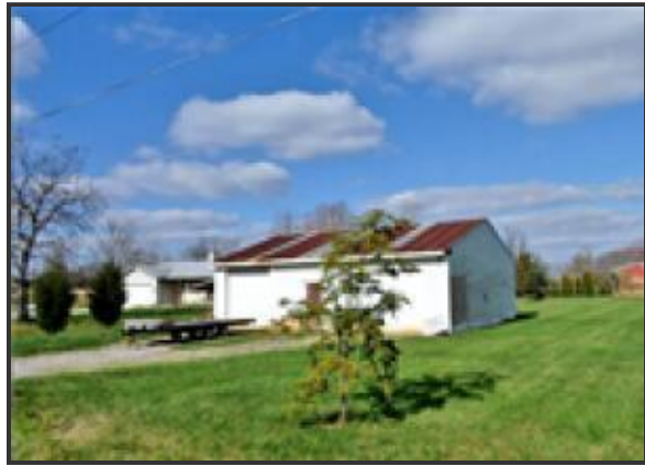
46 Cedar Park Ext. Pic. 2