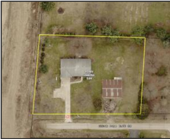
46 Cedar Park Ext. Pic. 1